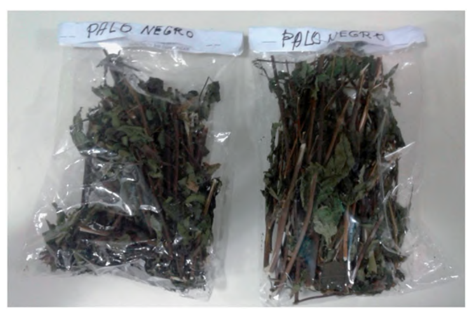
Figure 1. L. rivularis as it is sold in the street markets in Valdivia, Chile.

which could mimic neurotrophic factors, lower the oxidative stress status within the nervous system cells, increment neurotransmitters, or act as neuromodulators to accelerate neurogenesis 12,13. Among the treatment strategies for those degenerative diseases are cholinesterase inhibitors such as galantamine<sup>14</sup>. Phenolic compounds present in extracts from a vast number of edible fruits, mushrooms, and herbs including Salvia officinalis, Melissa officinalis, Laurus nobilis, Mentha suaveolens, Lavandula angustifolia, Lavandula pedunculata showed also anticholinesterase (AChE) activity, and are considered rich sources of molecules useful for the prevention and treatment of those neurodegenerative diseases^{15-17}.\\